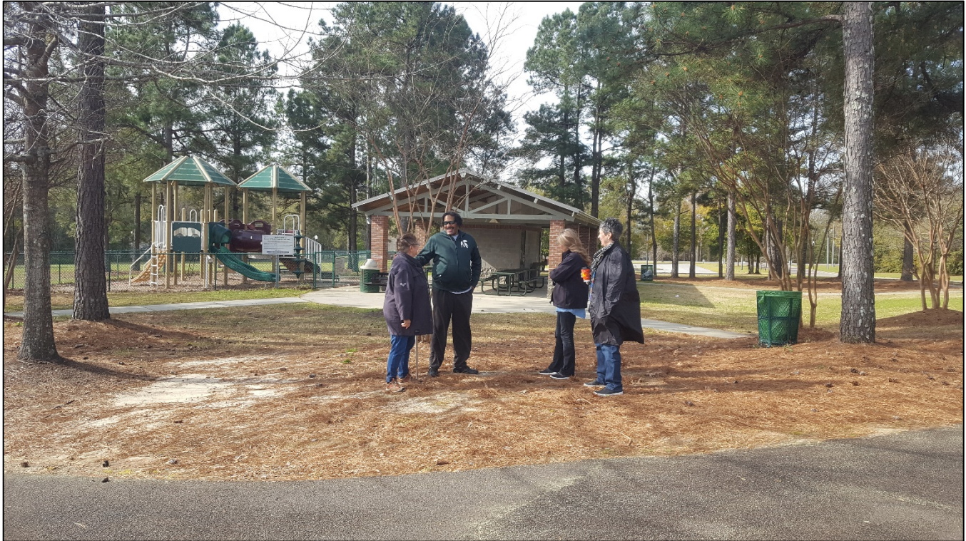
Figure 2: site photo

The artist may propose a design for one to three (1-3) chess tables, dependent upon the artist's use of the grant's $1,000. The total amount available at this time is $1,000. If all three tables cannot be commissioned for that amount, the project will be completed at a later date when more funding is available. At that time the Arts Council reserves the right to continue with the original artist or commission a new artist to complete the project.